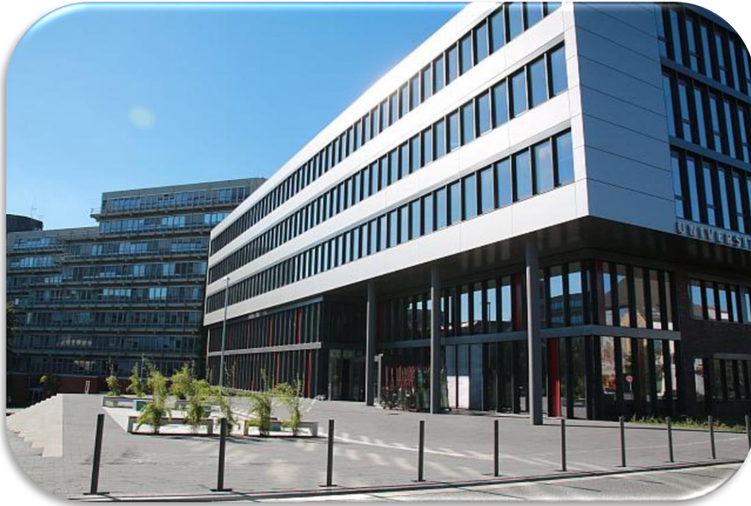
Q-Building